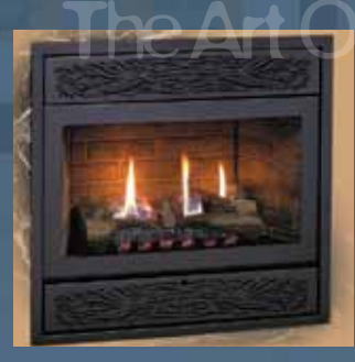
Shown with optional square 'Willow' faceplate