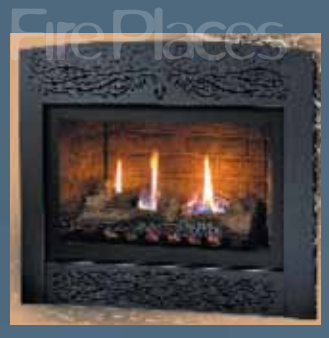
Shown with optional curved 'Willow' faceplate